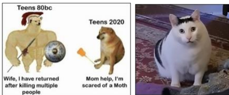
Figure 1. Common memes on social media

The content of social media directly affects the adolescents who view social media. Based on the questionnaire survey conducted by Ruta-Canayong2 in 2019, we can tell that the top three rankings of adolescents' interest in social media content are memes, trending videos, and pranks [3]. Therefore, we can infer that the contents that adolescents mainly view are largely consistent with these three categories and therefore are mainly influenced by these three types of contents.