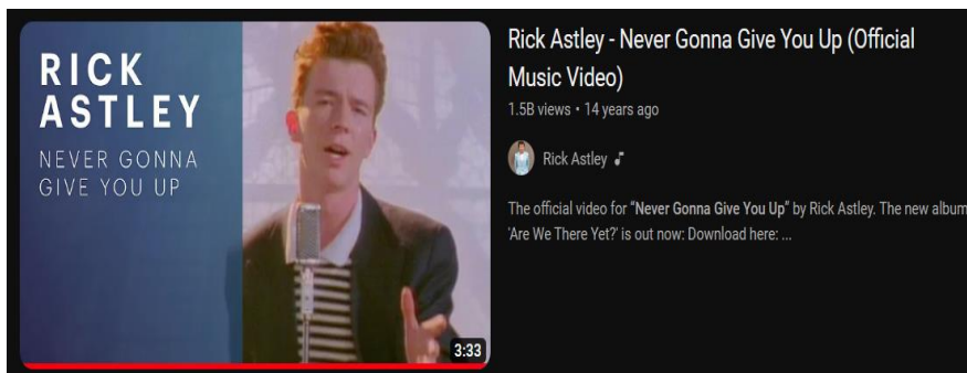
Figure 3. User-interactive pranks: Rick Roll (MV of Never Gonna Give You Up by Rick Astley)