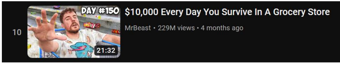
Figure 2. One of the most viewed videos by YouTube influencer Mr. Beast