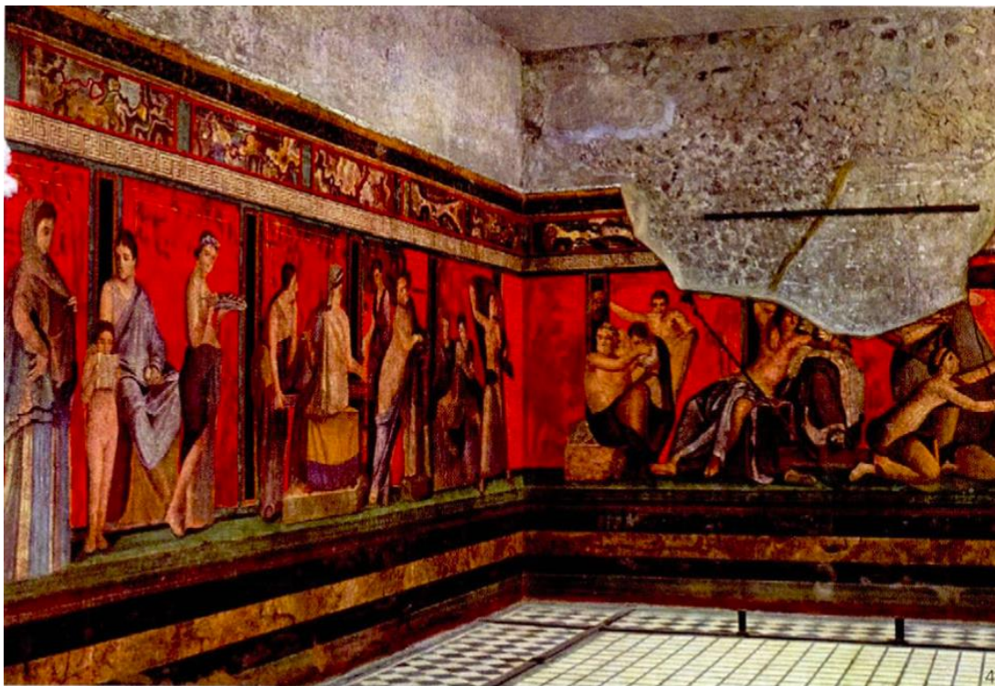
Figure 2. Rituals of Dionysus in the Villa of the Mysteries, Pompeii, wall paintings, mid-first century B.C. [7]

Classical pursuit of democratic architectural aesthetics, the development of the ancient Roman period to further standardize and promote the development of the art of columnar. From the scale of ancient Rome, the golden ratio for the creation of benchmarks, with stone as the building materials, for the development of the world's basic architectural form of the development of reference value, for future generations to leave valuable historical assets and influence to this day.