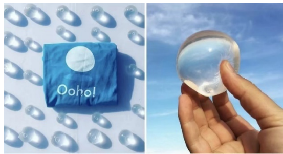
Figure 1. Ooho's new edible water ball

An orbital economy Innovative packaging intelligence technology In the consumer era, packaging design is of the utmost importance; however, the issues of mass production, brief product life cycles, and increased waste are inextricably linked to a variety of environmental pollutants and affect the environment throughout the product life cycle [3]. Intelligent packaging comprised of biomaterials has demonstrated promise as a sustainable alternative to plastics, not only in terms of reducing waste and the strain on landfills, but also in substitution for petroleum resources. Natural substances, processed biodegradable substances, soluble substances, and edible substances are all biomaterials. All of these materials are of natural origin, devoid of any toxic or chemical components. Moreover, they are biodegradable and recyclable by nature, and do not emanate any hazardous substances. The ecologically sustainable water container developed by university students in London, England, and featured in Figure 1. It represents a novel and inventive substitute for conventional plastic vessels. It is designed to decrease container pollution. It comprises ingestible "spherical" water encased in an edible film, which decomposes without producing any residue. It is capable of entirely resolving the critical issue pertaining to bottled water and eliminating packaging pollution.