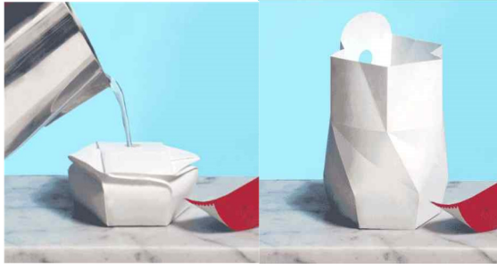
Figure 2. 100% organic instant food container