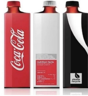
Figure 3. Square Coca Cola design