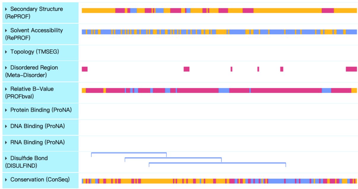
Figure 2. The COVID-19 S Protein Sequence Base Information

The S protein sequence information is shown in figure 2.