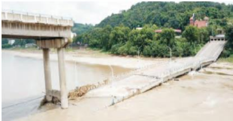
Figure 3. Pengshan Minjiang River Bridge Collapse Site [1]

Pengshan Minjiang Bridge is 16×30m prestressed reinforced concrete simply supported T beam, 494.7m long, 12.5m wide, is the main road connecting Pengshan City to the provincial scenic area Pengzu Mountain and Huanglongxi and the surrounding cities. As shown in Fig. 3, a total of 3 piers with a span of 120m collapsed. The flood's impact on the bridge primarily involves substructure erosion, leading to the washing away of the pier foundation and resulting in its suspension or even inclination, thereby compromising the bridge's stability.