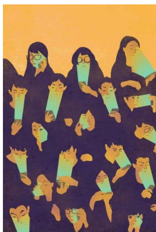
Figure 1 Social media floods college students' lives

1. Explore the relationship between social media use and college students' psychological well-being: Through in-depth analysis of the interaction between social media use and college students' psychological well-being, we aim to comprehensively understand the specific impact of social media on individual psychological well-being, including depression, anxiety, and ability to cope with pressure.