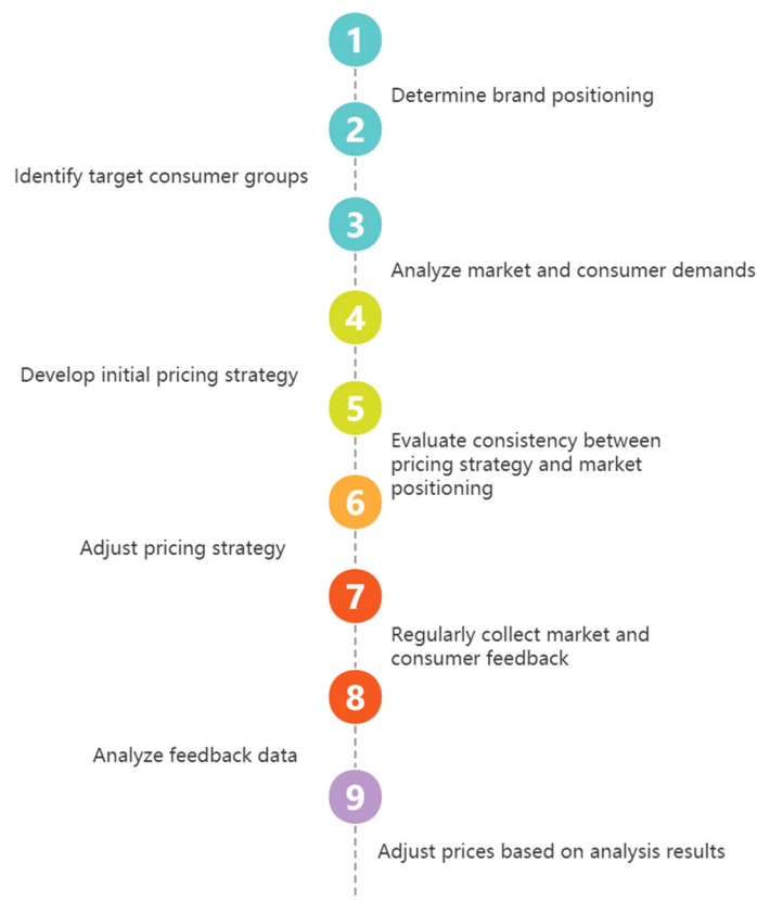
Figure 2. Process for Optimizing Pricing Strategy