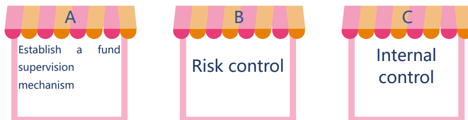
Figure 3. Measures to strengthen fund management

Digital transformation may lead to an increase in funding requirements and financial risks. Enterprises must strengthen fund management and risk control mechanisms to ensure the efficiency and safety of fund use, as detailed in Figure 3. The first key step is establishing an effective fund monitoring mechanism. Enterprises should leverage digital technologies to monitor fund flows in real time, including income, expenses, and financing activities, to ensure transparency and accuracy in fund use. Setting up an early warning system for potential fund shortages or surpluses allows enterprises to respond swiftly and adjust funding strategies accordingly. Secondly, risk control cannot be overlooked. During the digital transformation process, enterprises may face various potential risks, such as market risk, credit risk, and liquidity risk. It is necessary to develop comprehensive risk management measures, including risk assessment, setting risk limits, and risk diversification, to reduce financial risks. Thirdly, enterprises should also strengthen internal controls and standardize fund management processes to ensure the compliance and security of fund usage. Regular audits and internal checks can promptly identify and correct issues and vulnerabilities in fund management, preventing financial losses and waste.