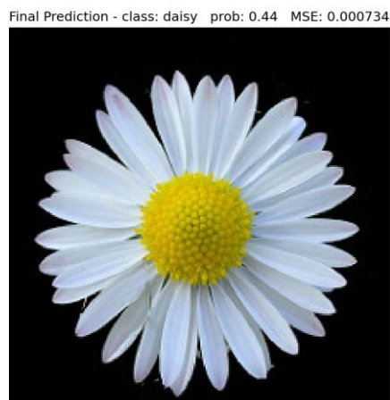
Fig. 2 The enhanced image, and its MSE is 0.000734.