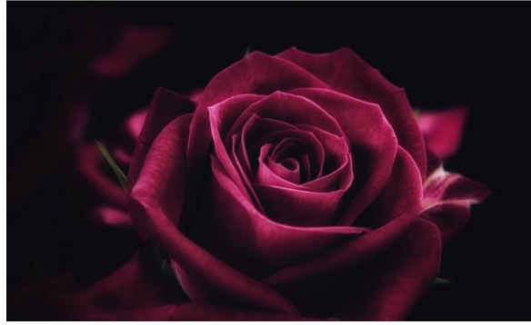
Fig. 4 The improved image, and its MSE is 0.000867 (Photo/Picture credit: Original).

Final Prediction - class: roses prob: 0.443 MSE: 0.000867