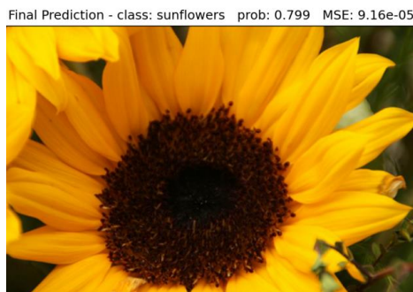
Fig. 3 The improved image, and its MSE is 9.16e-05.