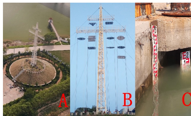
Fig 1. Tianjin Port Water Depth Signal Tower and Water Gauge

The Tianjin Port Water Depth Signal Tower is located at the Xingang Shiplock in Binhai New Area, Tianjin. The signal tower is approximately 350 meters away from the shiplock in a straight line. Below the signal tower is a concrete brick and stone structure, and above it is a steel structure tower. The tower is 27 meters high, with the lowest sign height of 12.63 meters. The tower is white, and there are ten black signs and ten signal lights above the tower, Used to indicate the rising and falling tides during the day or night, as well as the tide level information at the ship lock (see C in Figure 1 for the water gauge label), for the use of ships in the main channel of Tianjin Port and as a reference for flood control departments.