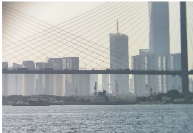
Fig 4. Overall situation observed by the observer at sea