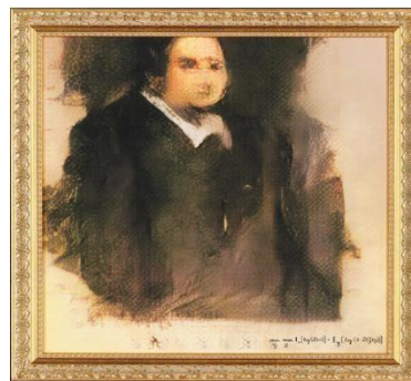
Figure 2. Portrait of Edmond Bellamy [7].

In 2015, a work generated by AIGC, "Portrait of Edmond Bellamy," fetched a high price at Sotheby's in London and attracted a lot of attention. This event marked AIGC's emergence on the art market. The Figure 2 is the exhibition of the work "Portrait of Edmond Bellamy".