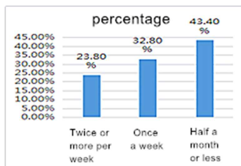
Figure 1. Survey results of the number of performances in Linhe District

Fourth, there is not enough publicity and the communication channels are not smooth. In the face of mass networking today, there are few reports in Bayannur media. Through the investigation of folk duet troupes in Xinhua Community, Linhe District, it is known that the frequency of duet performances in community compound accounts for 23.8%, 32.8% and 43.4% (see Figure 1). At the same time, a large number of old duet artists have chosen to change careers, which has caused the performance level of duet to decrease.