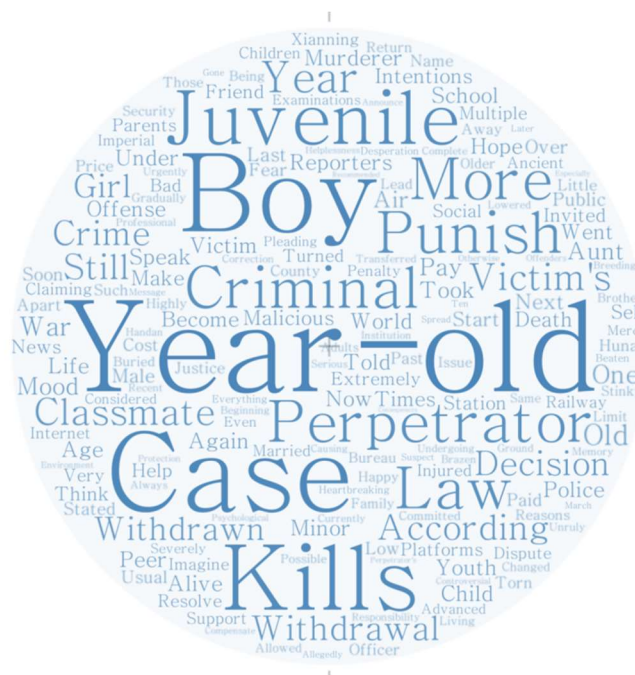
Figure 3. Word frequency of text

Before encoding, I conducted word frequency query on the text data. After eliminating irrelevant words, the obtained high-frequency word cloud is shown in Figure 1. The larger the font size, the more times it is mentioned. As can be seen from the figure, the text content mainly highlights the issues about "age", "killing", "classmates", "juveniles" and "crimes". This shows that the hot issues of juvenile crime have been widely concerned in recent years, and malicious injuries such as the killing of peers by minors have gradually become a hot topic of discussion.