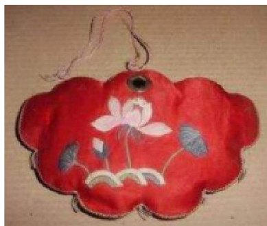
Figure 1. Start-up works

Fuyang embroidery has a long history, which can be divided into the start-up period, the rising period and the development period. The initial period can be traced back to the Warring States period, popular among the people, but by the feudal small peasant economy and regional culture of the limitations of the development is slow, to the plain, elegant embroidery-based, most of the shapes are simple and simple; Orange-red embroidery-based, most of the shapes are prominent and full, self-sufficient household-based, lack of market awareness; the development period is mainly after the reform and opening up, by the impact of the market economy, the Fuyang embroidery artists based on Bai Li take the initiative to adapt to the market changes, the theme of the group case is more abundant, and actively integrate into Suzhou embroidery and other skills, there is a trend of industrialization and marketization, but due to the loss of inheritors, the development of the Internet economy, and the impact of mechanized production, Fuyang embroidery urgently needs the operation of a new business model to promote the township village revitalization and development.