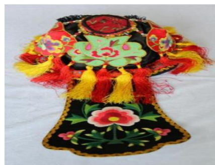
Figure 2. Up-to-date works