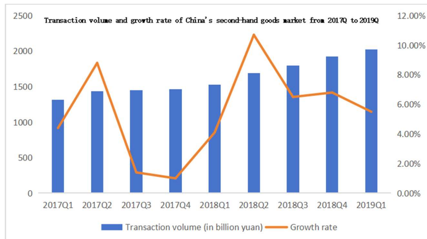
Fig. 1 Trend of Transaction Volume and Growth Rate of China's Second-Hand Goods Market from 2017Q1 to 2019Q1

on the utility of their idle goods, exploring the impact of goods' utility on the platform's profitability holds significant practical significance.