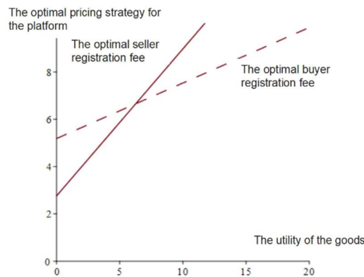
Fig. 3 Platform's Optimal Pricing Function with Respect to Product Utility

Further analysis of the relationship between product utility and the optimal buyer registration fee and optimal seller registration fee is illustrated in Fig.3, as shown below.