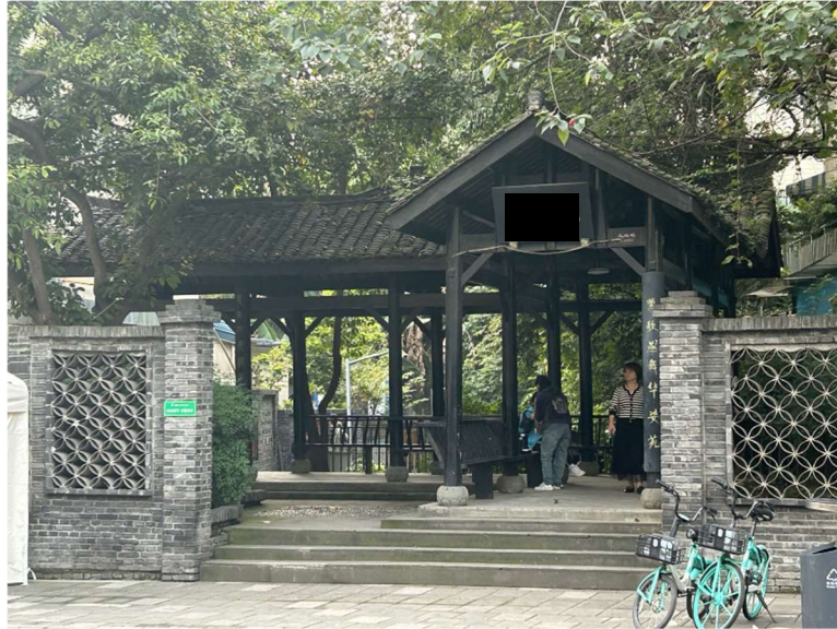
Figure 6. Yulin Street Public Activity Space