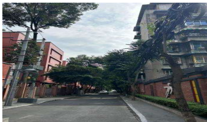
Figure 4. Vehicles are parked and parked indiscriminately in the street space , and people and vehicles are seriously mixed.

From the perspective of street space design , one is traffic unsafety. Vehicles have priority inside Yulin Street , the traffic flow is large, the road boundaries are often unclear, and serious mixing of people and vehicles occurs, which is even more dangerous for the elderly who are already slow to react . Most of the existing residential areas are old residential areas, and most of them do not have underground parking spaces. This also leads to a large number of vehicles parking on the streets . Narrow streets and alleys are often occupied by vehicles parked indiscriminately (Figure 4) . For the elderly with inconveniences , It is even more difficult to pass smoothly. There are many vehicular traffic around the criss-crossing branch roads and entrances and exits of residential areas. Motor vehicles are often parked illegally and there is a lack of safety measures, which can easily lead to accidents.