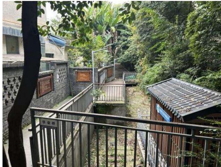
Figure 5. Schematic diagram of the poor current layout of individual roads

them. There are mostly continuous walls on both sides of the road with few windows. The elderly also need a sufficient sense of security in their daily lives .