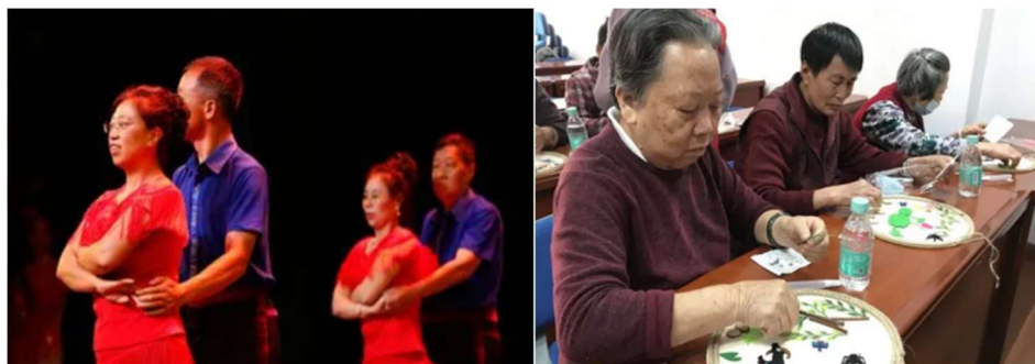
Figure 9. Colorful senior activities

The author believes that relevant activities such as "Elderly Calligraphy Competition", "Elderly Handicraft Art Festival", "Elderly Song and Dance Show" can be held regularly at appropriate places in the street, and the elderly group is encouraged to actively participate. When the elderly complete a dance, a calligraphy and painting, or a song, if the people next to them receive this sense of accomplishment and recognize, encourage and praise it, then the behavior of the elderly will be strengthened and feedback will be formed. People's psychology will be satisfied, and they will be more motivated to do other things, learn new knowledge, and overcome difficulties, which is of great help in meeting the self-realization needs of the elderly .