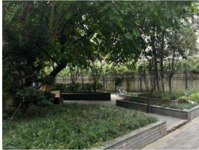
Figure 3. Yulin street space dominated by dark colors