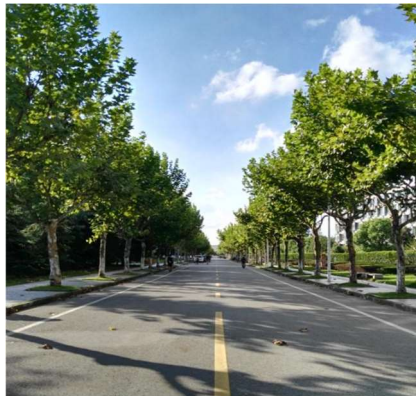
Figure 7. Road space with sufficient lighting

The author believes that the aging-friendly design of street space can be carried out with the goal of improving the physical fitness of the elderly. First of all, attention should be paid to the creation of green belts in street spaces . While ensuring air quality that is closely related to human health , it also provides relatively sufficient and clean space for the elderly to engage in appropriate exercise (such as square dancing, running, etc.) of oxygen , because proper exercise is conducive to the maintenance and even growth of human body muscle strength . Therefore, it can be used to meet the basic physiological needs of the elderly. Secondly , due to the degradation of the body functions of the elderly , they need more daily nutritional supplements than young people, especially the absorption of calcium . Therefore, some indirect nutrition intake channels can be set up in the street space design , such as: The height and arrangement of trees can be planned to ensure that people moving in the street space can receive sufficient light (Figure 7) . Ultimately, the above methods will be used to help improve the physiological health level of the elderly and meet the physiological needs of the elderly group .