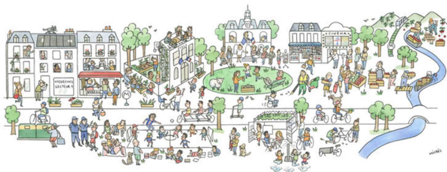
Figure 8. Schematic diagram of “15-minute city”

At the same time, I think you can also refer to the "15-minute city" theory first proposed by Carlos Moreno, a professor at Sorbonne University in 2016. He defined a highly flexible urban model - all citizens can live within 15 minutes. Meet daily needs. The elderly can reach their destination within a short period of time after going out for related activities. This not only reduces unnecessary travel time, but also reduces the incidence of accidents. It is also of practical significance for meeting the safety needs of the elderly.