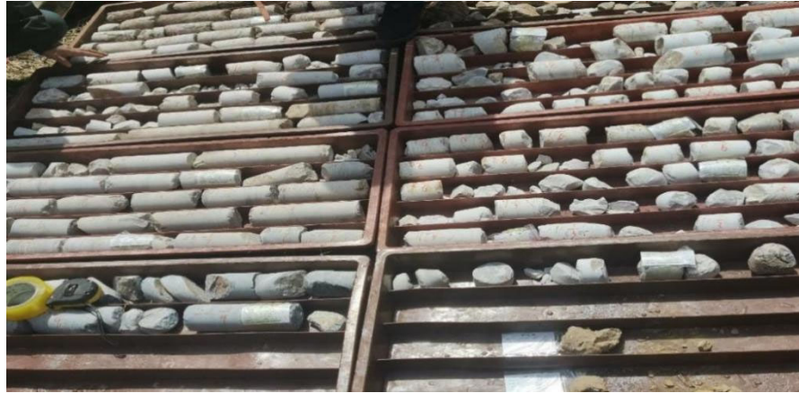
Figure 1. Core catalog