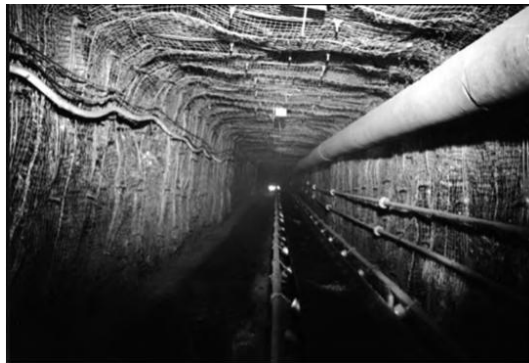
Fig 1. Application Diagram of Roadway Excavation Support Technology in Coal Mines

particularly surrounding rock deformation and water erosion[2]. These conditions can cause rock expansion and deformation under pressure, compromising support stability and leading to frequent accidents such as roof collapses. Additional challenges include complex geological conditions and variability in the expertise of construction personnel. Moreover, the multi-stage nature of coal mining requires seamless coordination of processes. While support effectiveness is adequate under favorable geological conditions (Fig. 1), it significantly deteriorates in complex environments, affecting both the pace and quality of excavation. Therefore, integrating support technology with excavation work is crucial. Most mining operations require excavators and involve hazardous procedures like working under unsupported roofs and manual anchoring, necessitating robust safety measures. To ensure effective application of support technologies, mines must implement scientifically sound safety protocols tailored to site-specific conditions.