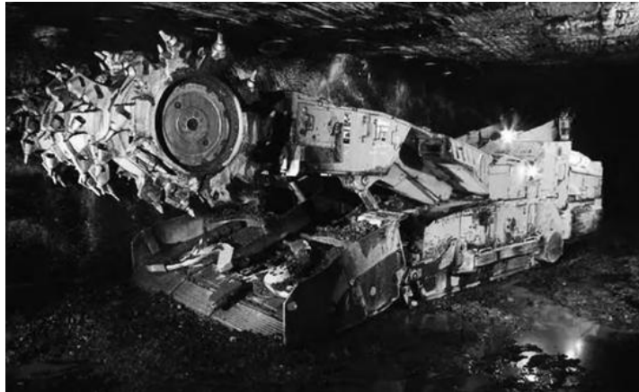
Fig 3. Continuous Mining Excavation Equipment

while continuously optimizing and innovating the construction process to enhance safety and stability in excavation management. Continuous miners feature a large cutting width, enabling integrated control of multiple processes—such as coal cutting, loading, and transportation—during construction and excavation management. This significantly improves excavation efficiency while effectively mitigating adverse effects caused by varying cross-sections on construction. As a result, this excavation technology is widely applied in large-section coal roadways. Layered excavation methods can be adopted to enhance the overall benefits of the construction process. A continuous mining excavation equipment is illustrated in Figure 3.