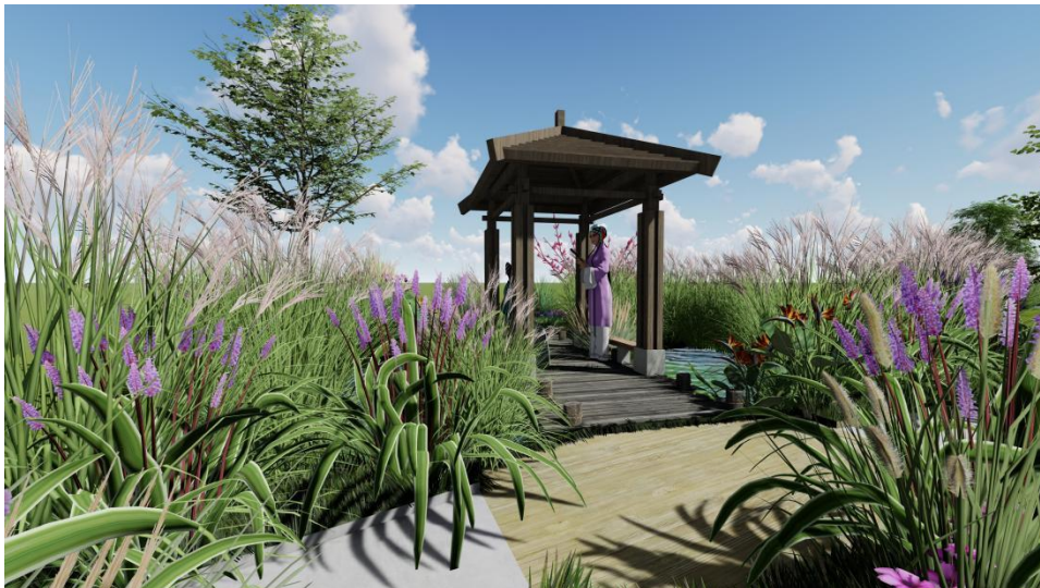
Figure 3. Schematic diagram of modern garden scene revitalisation

In the vertical space, the modern garden should focus on shaping the rich and varied spatial levels, in order to avoid the flattening of the landscape. Drawing on the growth characteristics of plants in ‘Qin Feng·The reed’, starting from the ground lawn, ground cover plants, gradually upward transition to flowers, shrubs, trees and other plant species of different heights. In the waterfront area, low aquatic plants can be planted first; followed by taller herbaceous plants such as reeds and dicotyledonous grasses; and then the shrub layer, such as lilacs and violets, which can add colour and a sense of hierarchy in the garden in different seasons; and finally the tall tree layer, whose crowns form the contour of the upper space. Through this plant configuration, several layered plant landscape zones are formed in the vertical direction to enrich the visual experience(Figure 3).