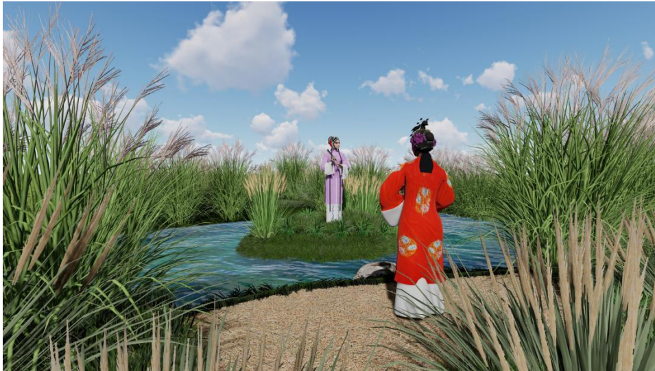
Figure 1. ‘Qin Feng·The reed’ Restoration of garden elements

where ‘he’ and ‘islet’ both refer to water Here ‘he’ and ‘islet’ both refer to small pieces of land or islands in the water. These islands and islets are hidden in the river, creating a mysterious atmosphere for the appearance of the ‘islet’, and also becoming a symbol of the goal and hope in the heart of the seeker. Their existence not only enriches the landscape level of the garden, but also adds a fantastic colour to the whole garden. Although mountains are not explicitly mentioned in the poem, it can be surmised from ‘Tracing the way, the road is blocked and long’ that there may be terrain elements such as mountains in the distance. The mountains, as a background, can add a grand and far-reaching feeling to the landscape, and at the same time, they can also contrast with the water bodies, plants and other elements in the near distance, enriching the hierarchy of the landscape(Figure 1).