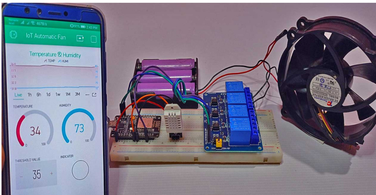
Figure 3. IoT intelligent control system

3. Cloud Server: The cloud server is implemented using a cloud computing platform, such as Amazon Web Services (AWS) or Google Cloud Platform (GCP). The server is responsible for storing and managing the system's data, as well as facilitating communication between the mobile app and the microcontroller. The functionality verification of the water pump automatic irrigation circuit in the greenhouse IoT intelligent control system is shown below in Figure 3. When the watering conditions are met, the water pump starts and simulates irrigation.