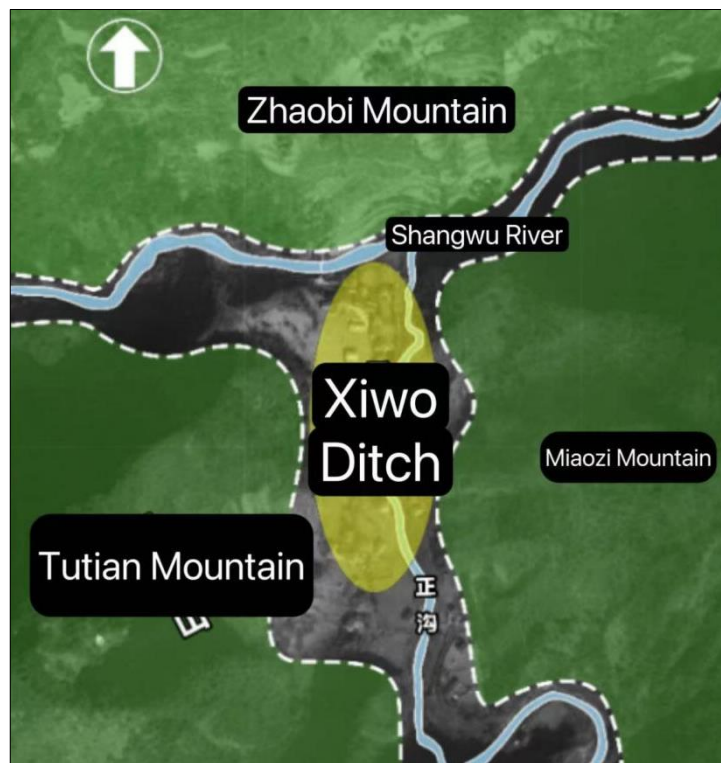
Figure 2. Diagram of Qiangzhai Mountain water pattern in Xiwo Village, Shangwu Village, Beichuan County, Mianyang City, Sichuan Province

from north to south, and less than 80 meters wide from east to west at the narrowest point. The settlement site presents a spatial layout of a strip as a whole, but the architectural layout is not compact, but the upper, middle and lower villages are scattered on the north-south axis. The outside of the building is surrounded by tilled fields, and the houses and fields are connected to each other, which makes farming convenient, beautiful environment and pleasant climate. The village as a whole constitutes the spatial texture of "building - road - pastoral - water system - mountain", and each element reflects and lives together.