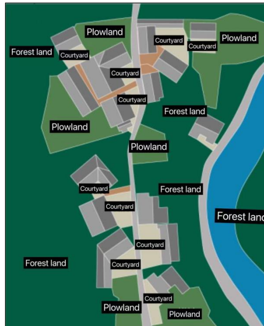
Figure 3. Spatial layout diagram of courtyard in Shangwu Village, Beichuan County, Mianyang City, Sichuan Province