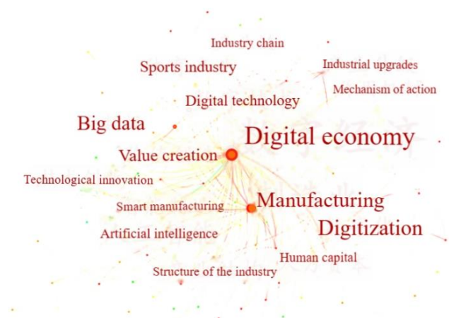
Figure 2. 2008-2022 Co-occurrence of keywords in digital economy and manufacturing industry research