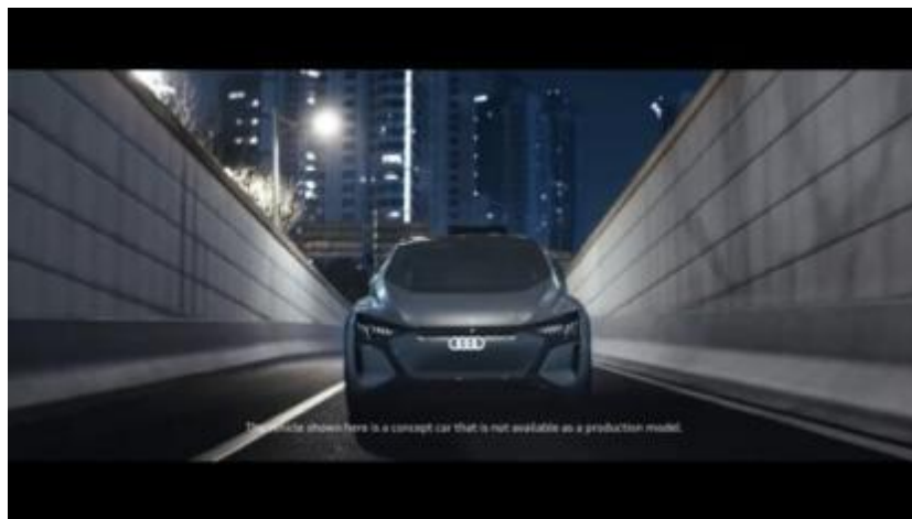
Figure 2. Auto show site

In the process, we focus on data analysis and effect evaluation, constantly optimize strategies, and learn from the successful experience of other industries. Through the implementation of brand synergy strategy, enhance the visibility and influence, realize the sharing of resources and complementary advantages. Taking an automobile exhibition event as an example, the joint planning of the event attracted a large number of visitors and improved the visibility and reputation. To sum up, the brand synergy strategy needs to comprehensively consider market research, positioning, organizational structure, promotion, resource sharing and data analysis, etc., to achieve collaborative development and win-win. (As shown in Figure 2)