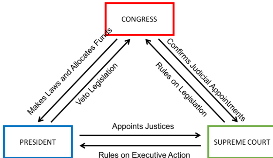
Figure 1. Checks and Balances

When formulating resource allocation strategies, the actual needs and characteristics of the scientific research team should be fully considered, and personalized allocation plans should be formulated. At the same time, a sound resource management mechanism and evaluation system should be established to conduct regular evaluation and feedback on the effect of resource allocation, so as to adjust and optimize the allocation strategy in time.