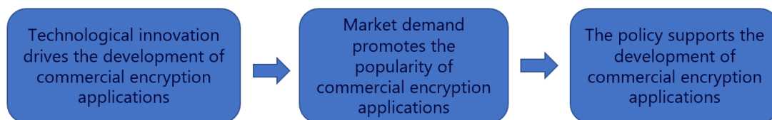
Figure 1. Three aspects of opportunities for commercial crypto applications

Technological innovation promotes the development of commercial encryption applications: With the continuous innovation of cryptography, artificial intelligence and other technologies, the application of commercial encryption applications in the field of vehicle networking has also been continuously expanded. The emergence of new encryption algorithms, authentication mechanisms and other technologies provides more secure and reliable information protection for vehicle networking. Market demand to promote the popularity of commercial encryption applications: With the continuous expansion of the Internet of vehicles market, users' demand for information security is also increasing. Commercial encryption applications can meet users' needs for information protection, improve the security of vehicle networking systems, and further promote the popularity of commercial encryption applications [8]. Policy support to help the development of commercial encryption applications: Government departments attach great importance to the information security of the Internet of vehicles, and have introduced a series of policies and regulations to promote the development of commercial encryption applications. The implementation of these policies provides a good development environment for commercial encryption applications and promotes its wide application in the field of vehicle networking.