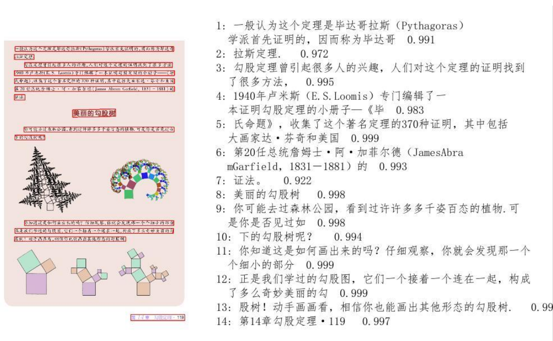
Figure 1. Textbook PDF Recognition Results

As shown in Figure 1, the images obtained in this study were processed through PaddleOCR for OCR text recognition. In order to better present the OCR text recognition results, the textbooks and the recognition results are juxtaposed for comparison, with the textbook on the left and the recognition results on the right.